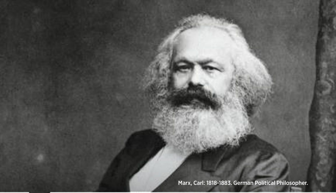
Marx, Carl: 1818-1883. German Political Philosopher.