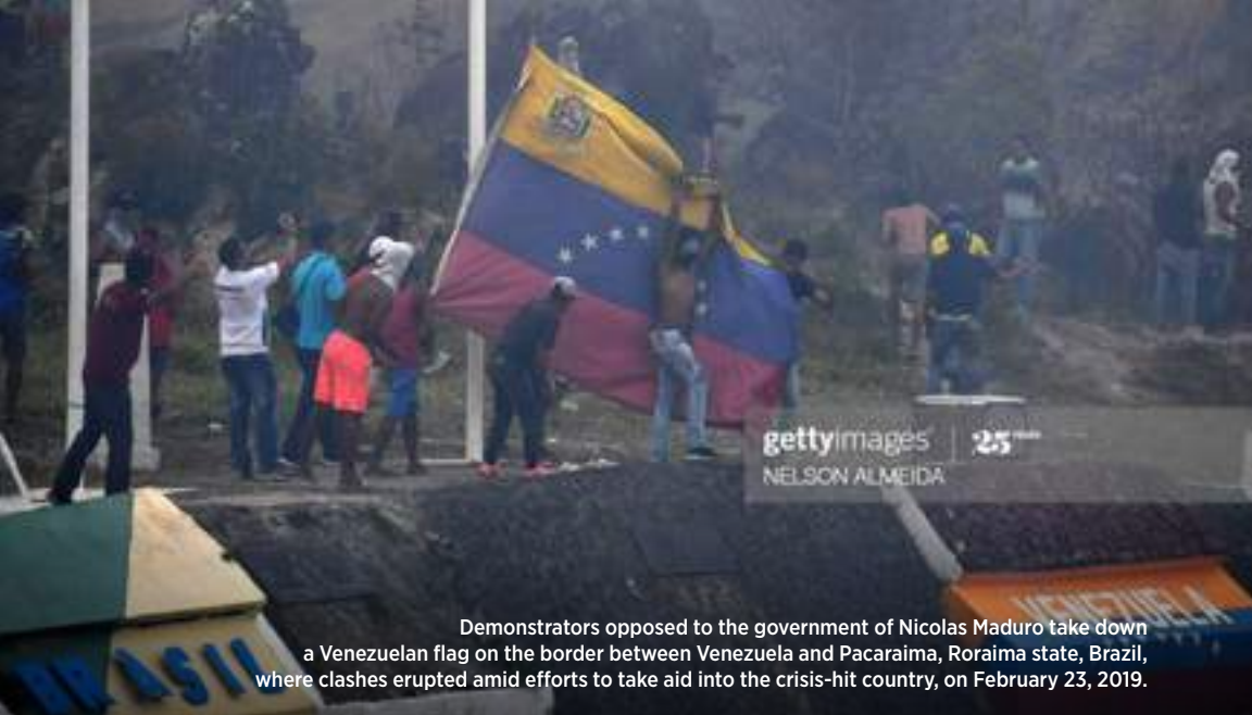
Demonstrators opposed to the government of Nicolas Maduro take down a Venezuelan flag on the border between Venezuela and Pacaraima, Roraima state, Brazil, where clashes erupted amid efforts to take aid into the crisis-hit country, on February 23, 2019.