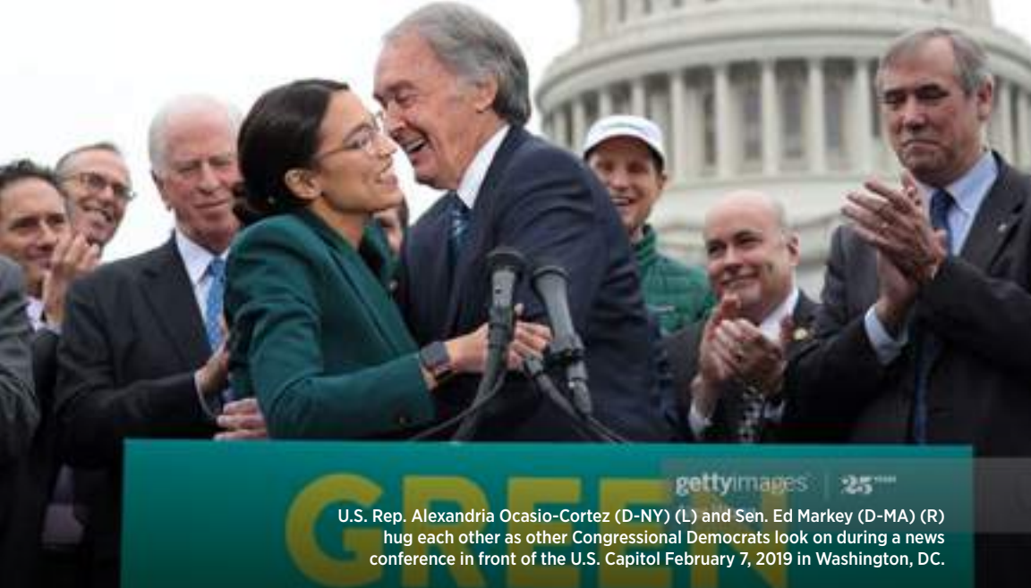
U.S. Rep. Alexandria Ocasio-Cortez (D-NY) (L) and Sen. Ed Markey (D-MA) (R) hug each other as other Congressional Democrats look on during a news conference in front of the U.S. Capitol February 7, 2019 in Washington, DC.