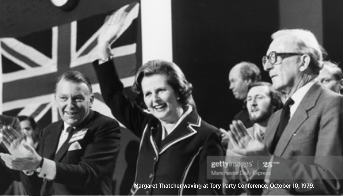
Margaret Thatcher waving at Tory Party Conference, October 10, 1979.