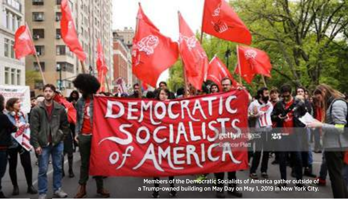
Members of the Democratic Socialists of America gather outside of a Trump-owned building on May Day on May 1, 2019 in New York City.